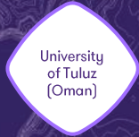
University of Tuluz (Oman) Growth Advisory