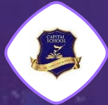
Capital School W.L.L. Risk Advisory