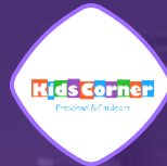
Kids' Corner Preschool and Childcare CFOs Advisory