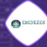
Ebenezer Private School Technology Advisory