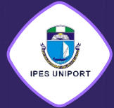
Institute of Petroleum Studies, Uniport (Nigeria) Audit and Assurance