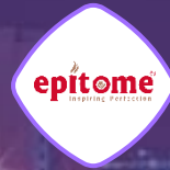
Epitome Restaurant and Coffee Shop