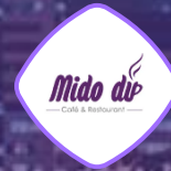
Mido du Café