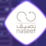
Naseef Restaurant W.L.L.