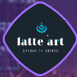
Latte Art Food and Beverage Co. W.L.L.