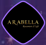
Villa Arabella Restaurant and Café W.L.L.