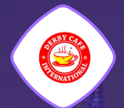
Derby Cafe International Bahrain W.L.L.