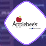
Applebee's Restaurant Bahrain