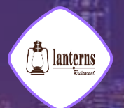
Lanterns For Restaurant Management W.L.L.