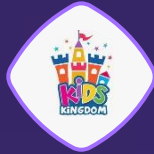
Kids Kingdom Entertainment W.L.L.